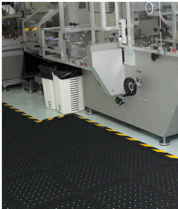
Hog Heaven ® Drainable Tiles