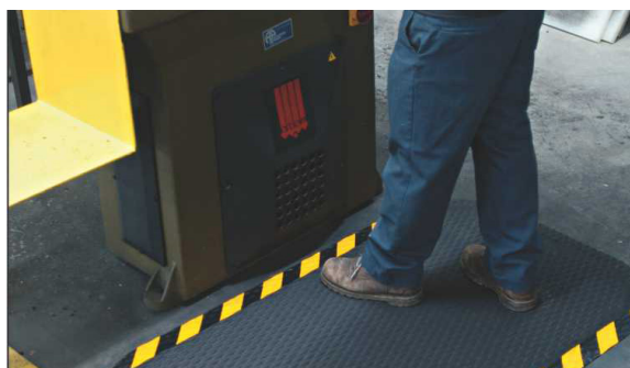
Hog Heaven ® Mats